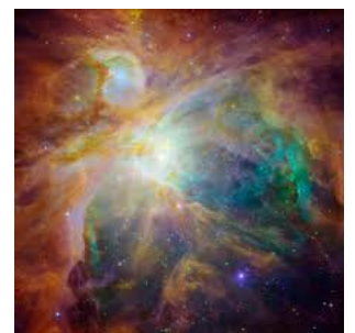
Figure 3 NASA - Peace