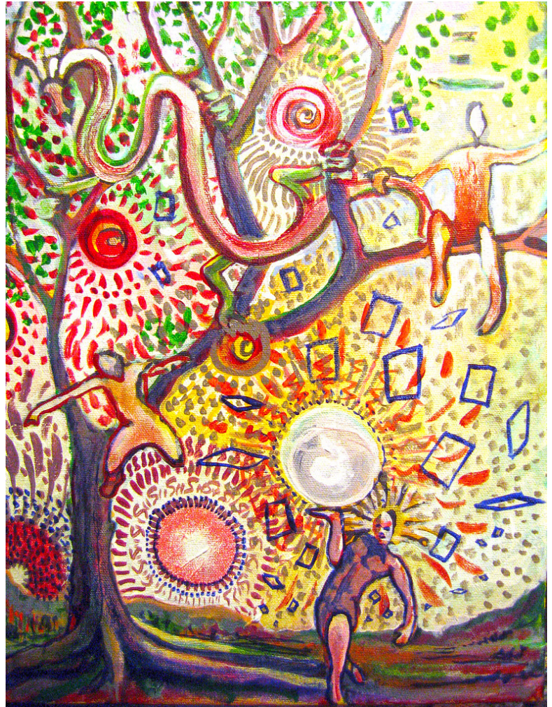
Figure 3 The tree of life gnosis, painting, Scott Richard