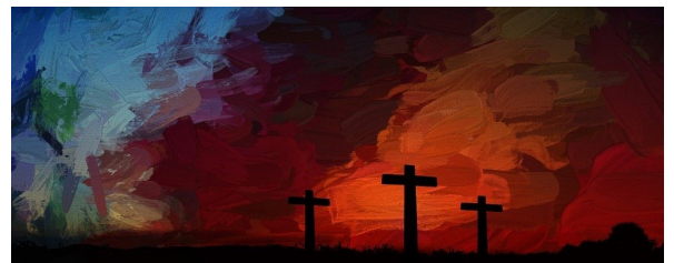
Figure 4 Crucifixion

Faithful God, the resurrection of Your Son has given us new life and renewed hope. Help us to live as new people in pursuit of the Christian ideal. Grant us wisdom to know what we must do, the will to want to do it, the courage to undertake it, the perseverance to continue to do it, and the strength to complete it.