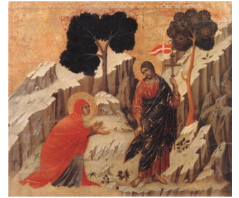
Figure 1 Duccio di Buoninsegna

Easter Sunday marks the commencement of 50 days of celebrating and coming to understand the mystery of Christ's Resurrection. It is a joy-filled and challenging time in our Liturgical calendar as we journey with the women and men, who had come to know Jesus while he was alive, as they wrestle with the concept that he was coming back only for a short time to send them apostles on their mission to tell the world of the good news of Jesus' resurrection.