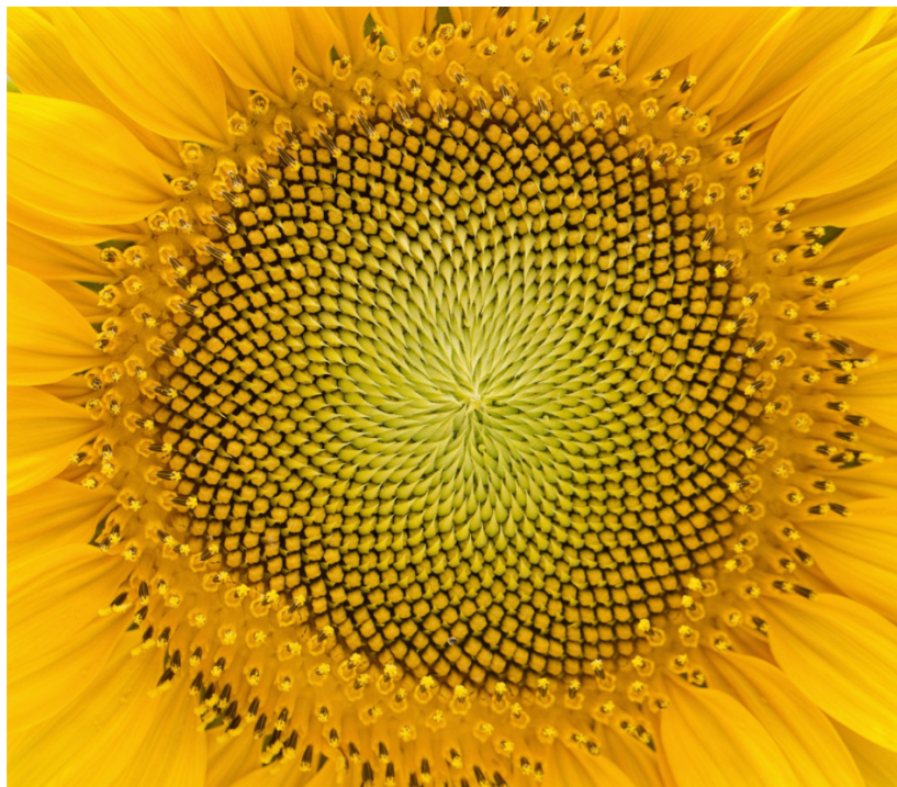
Figure 6 The Spirit of the Lord is upon me