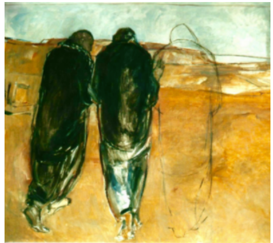
Figure 5 Give without payment

Glory be to the Father, and to the Son, and to the Holy Spirit. As it was in the beginning is now and ever shall be, world without end. Amen