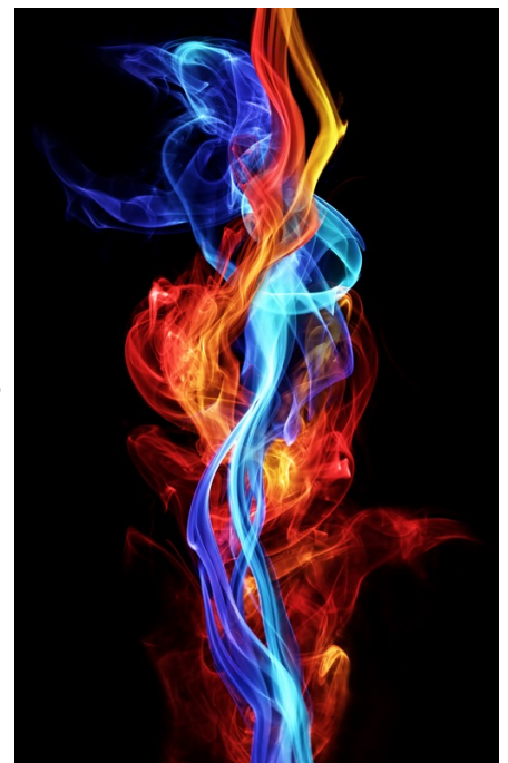
Figure 4 No one grows or is able to give life with strength alone

Give us the depth of soul, O God, to constrain our might, to resist the temptations of power, to refuse to attack the attackable, to understand that vengeance begets violence and to bring peace, not war, wherever we go.