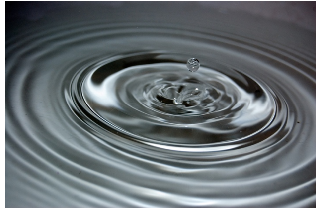
Figure 3 The Spirit Ripples out full of grace - person to person, receiving and giving.

Thanks be to God for good and faithful friends. Lights for each other, on our journeys. Cups of living water, held to our lips. Healing oil poured on our heads Wise Ones, for our guiding.