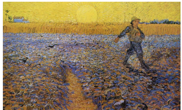
Figure 2 Freely give what you have been

Where Two or Three are gathered in my name, Know I am there to be with you.