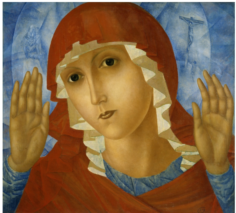
Figure 3 Kuzma Petrov-Bodkin - The Mother of Good Tenderness

Under your protection, we seek refuge, Holy Mother of God. Do not disdain the entreaties of we who are in trial, but deliver us from every danger, O glorious and blessed Virgin. Pope Francis