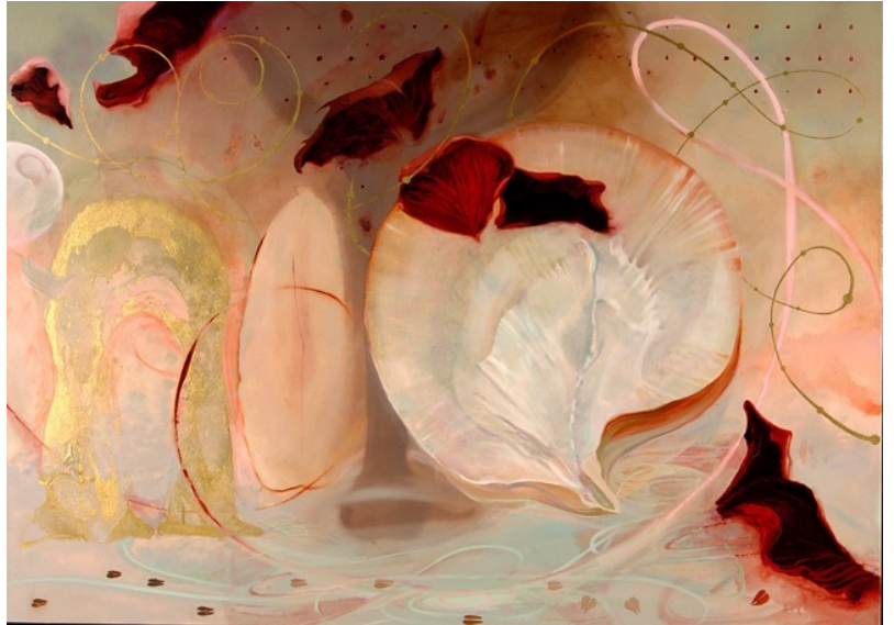
Figure 4 Ciel Bergman, Her compassion . Accessed here.