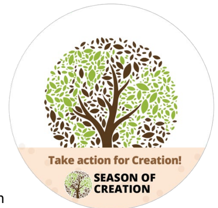
Figure 3 Seasons of Creation Resources: Downloaded 16 September 2020