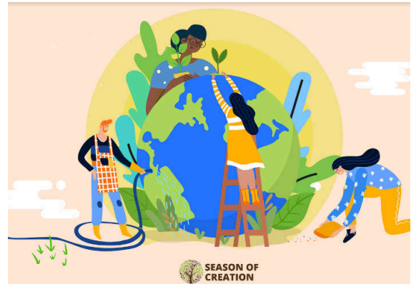
Figure 2 Seasons of Creation Resources: Downloaded 16 September 2020