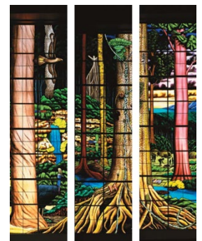
Fig4 Windows 16-18 at St Monica's Cathedral

God of all creation, as we journey together in this Great Southern Land, We pray for healing, forgiveness, and unity, Creating a path of good will, with justice and compassion. Jesus, through the power of your love, You have given us the courage, wisdom, and strength To share our gifts and talents in humility. In peace and understanding we reconcile with each other. Creator Spirit, we come together in prayer and thanksgiving For the many blessings we have received. Allow your Spirit to wash over us and give us strength to walk together as one.