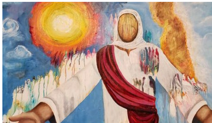
Figure 2 Come from Berry's Divine Designs