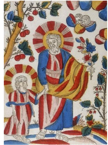
Figure 2 St Joseph and Jesus walking hand-in-hand.

Hail, Guardian of the Redeemer, Spouse of the Blessed Virgin Mary. To you God entrusted his only Son; in you Mary placed her trust; with you Christ became man. Blessed Joseph, to us too, show yourself a father and guide us in the path of life. Obtain for us grace, mercy, and courage, and defend us from every evil. Amen.