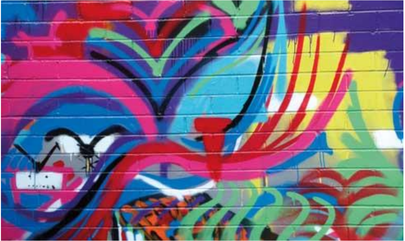
Figure 3 Seasons of Light accessed here .