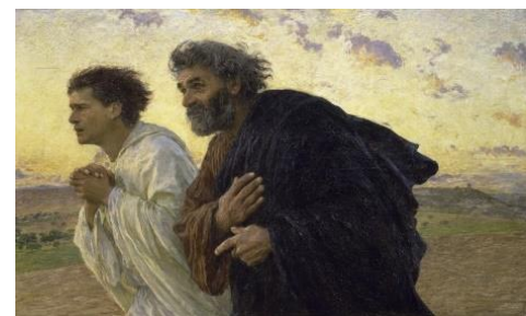
Figure 2 The Disciples Peter and John Running to the Sepulchre on the Morning of the Resurrection, c.1898 . Fine Art. Britannica ImageQuest,

It is important for us to remember that often the reality of new beginnings can be times of uncertainty and even challenge. It often takes time for the new reality to be actualised into joy. For example when starting a new amazing job you must learn the role, connect with new workers and understand new ways of being and operating. When a child leaves primary school and enters high school, the adjustment can take time as we may grieve our growing child and yet as the days go by we come to feel the joy their growth into young adulthood can bring.