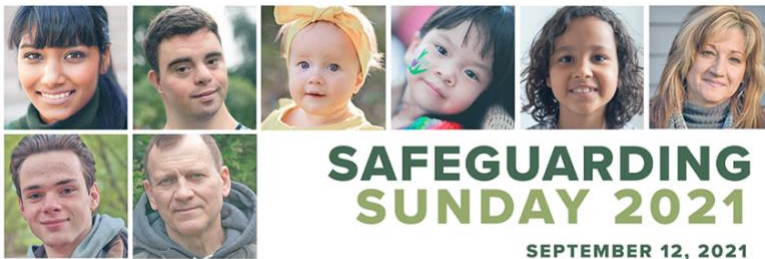
Figure 2

The Catholic Church in Australia marks Safeguarding Sunday (formerly Child Protection Sunday) on the second Sunday of September, at the conclusion of National Child Protection Week. Safeguarding Sunday seeks to acknowledge the immense damage caused by the sexual abuse of children and adults at risk, including by priests, religious and lay people within Catholic contexts. It makes a commitment to practices and protocols that create and