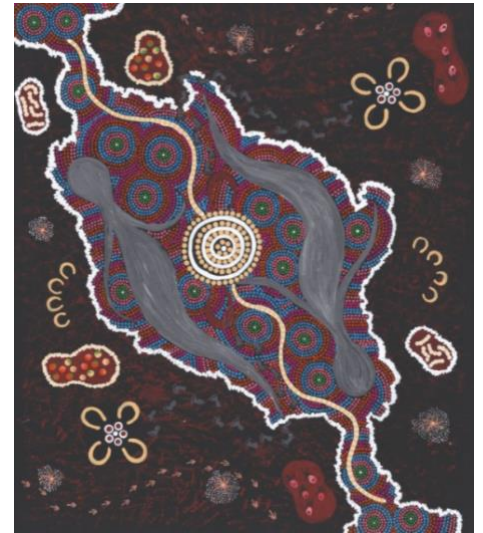
Figure 1 Image and Words: 'Deep Listening' by Shirleen Campbell, Alice Springs

Grandmothers' Story: "As you may know, in Aboriginal culture, our country and its landscape are our classroom. We connect to country as we learn and grow into adults. Our country is always ready to teach our mob and to look after us. This painting shows two grandmothers (sisters) sitting around the campfire teaching the young girls and boys about growing up and walking in two worlds. Here you can see the two grandmothers, emu footprints, bush tucker and spinifex. The boys and girls are sitting around their campfires using deep listening to learn about country and being ready for the two worlds. The footprints are the grandmothers walking around."