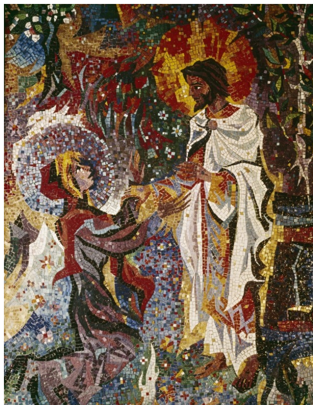
Figure 1 Christ and Mary Magdalene. Fine Art. Britannica ImageQuest, Encyclopædia Britannica, 25 May 2016. quest.eb.com/images/107_3349556 . Accessed 6 Apr 2023.

When we are faced with situations in life that stun and confuse us, our minds often enter overdrive and begin thinking about a multitude of different things. As faithful followers of Jesus, we know that he is Risen and that he is with us always, yet in the face of the unexpected our knowledge can abandon us. Jesus is not just for fair weather, he is with us through it all even if we don't immediately recall.