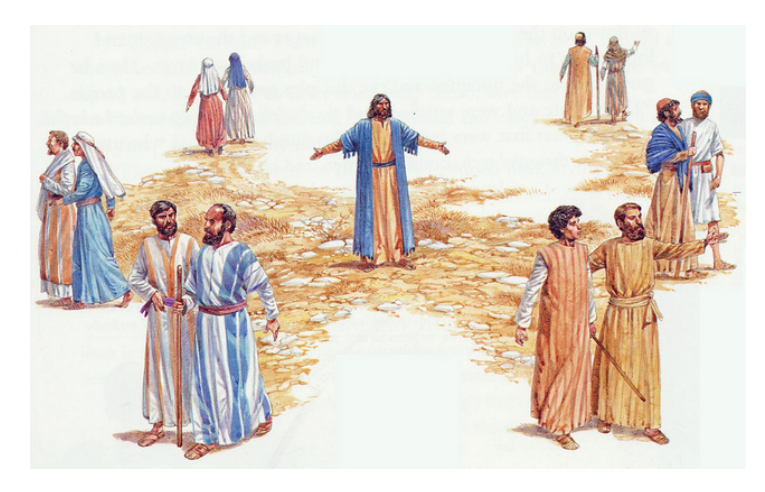
Jesus sends out His disciples two by two.

The Gospel of the Lord Praise to you Lord Jesus Christ