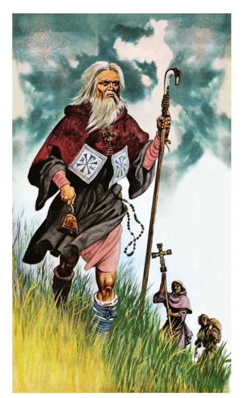
Figure 2 Saint Patrick takes God's message across Ireland on foot. Photograph. Britannica ImageQuest, Encyclopædia Britannica, 25 May 2016. <a href="mailto:quest.eb.com/images/108_1095051">quest.eb.com/images/108_1095051</a>. Accessed 6 Apr 2023.