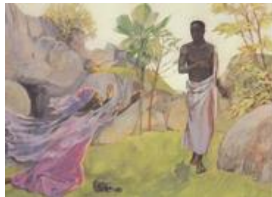
Figure 2 Easter - Christ appears to Mary by Jesus Mafa Accessed at:

But Mary stood weeping outside the tomb. As she wept, she bent over to look into the tomb; and she saw two angels in white, sitting where the body of Jesus had been lying, one at the head and the other at the feet. They said to her, "Woman, why are you weeping?" She said to them, "They have taken away my Lord, and I do not know where they have laid him." When she had said this, she turned around and saw Jesus standing there, but she did not know that it was Jesus. Jesus said to her, "Woman, why are you weeping? Whom are you looking for?" Supposing him to be the gardener, she said to him, "Sir, if you have carried him away, tell me where you have laid him, and I will take him away."