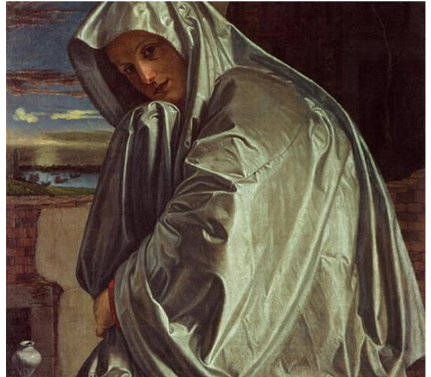
Figure 1 Image: St. Mary Magdalene Approaching the Sepulchre. Fine Art.

Mary Magdalene is mentioned fourteen times in the New Testament. Technically, she is Mary of Magdala; Magdala being her hometown, a village on the shore of the Sea of Galilee. She was a key figure in those who were influenced by and followers of Jesus. She stayed beside Jesus throughout his crucifixion and she was one of the women who attended his tomb, only to find it empty. Perhaps the climax in the story of Mary Magdalene was when Jesus appeared to her at the tomb. She was the first person to see Jesus after his resurrection and the first to share the news of his resurrection. Because of this, she was given the title of Apostolorum Apostola , or 'Apostle to the Apostles.'