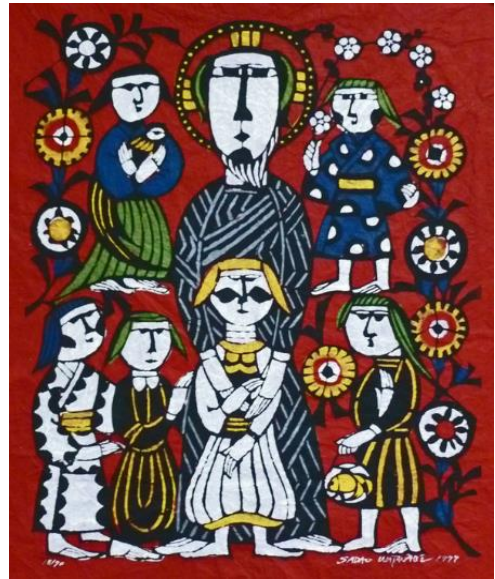
Sadao Watanabe's stencil print of Jesus and the little children from Sacred Art Meditations Viewed 17 th October 2023