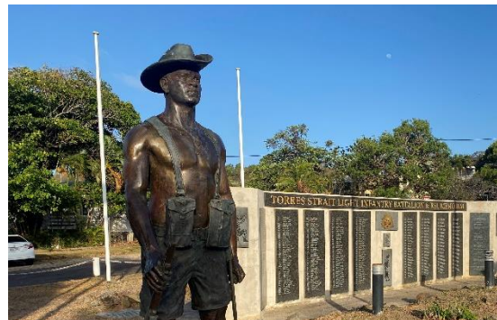
Waiben's war memorial