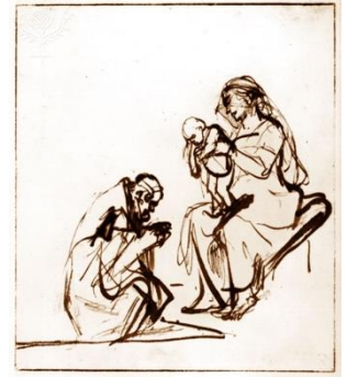
Figure 1 Rembrandt, Adoration of the Magi, Draw..

As a celebration in the Church, the Solemnity of Christ the King is a relatively 'young' one. In the years following WWI, the Catholic Church faced many challenges as a consequence of a changing world society. Governments that emerged post WWI were fragile and often unstable, creating an environment of uncertainty. This uncertainty was coupled with rising secularism and atheism. Pope Pius XI responded to this changing world in his encyclical Quas primas . The Solemnity of Christ the King was instituted as part of this encyclical as a reminder that even though 'governments may come and go, Christ will reign as King forever (USSCB, 2023)'. Whilst secularism continues to thrive, and often we are left to feel as though our faith should be a private matter, the Solemnity of Christ the King gives us the opportunity to declare to the world, and remind ourselves, that Jesus Christ, the risen image of an always loving God, is Lord of the Church and the ultimate 'King' of our world.