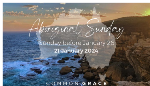
Promotional material for Aboriginal Sunday.

In 1939, William Cooper, a First Nations Christian Leader called for the Australian Church to 'have heart' and work to bring about justice that is life-giving to the First Peoples. He advocated for 'Aboriginal Sunday' - the Sunday prior to 26 th January – to be a day of prayer, reflection, and solidarity, and to acknowledge the impact of colonisation. This year in the Church's liturgical calendar, Aboriginal Sunday fell on 21 st January 2024, the 3 rd Sunday in Ordinary Time.