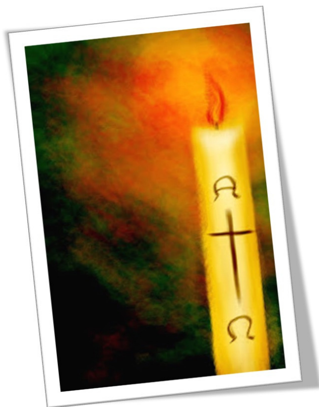
Easter candle - Abstract artistic pastel style Christian religious background.

In the Catholic tradition, the Paschal Triduum concludes with the Easter Vigil and the Church replaces her sense of mourning with a sense of anticipation. The celebration of the Easter Vigil is unlike any other celebration in the Church year! There are typically four parts to the Vigil: The Solemn Beginning of the Vigil, Liturgy of the Word, Baptismal Liturgy and Liturgy of the Eucharist- each contributing to the grandeur of this night of nights for the Church.