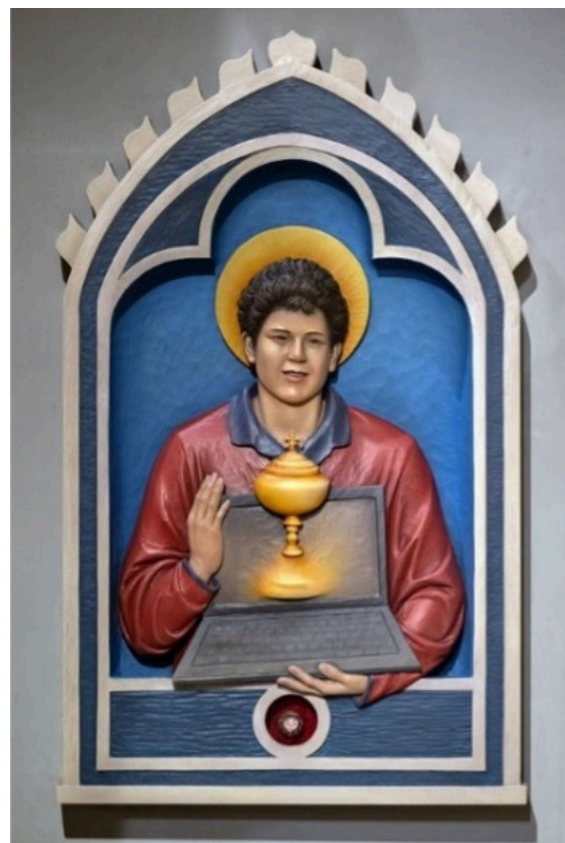
The Pontifical Mass of Blessed Carol Acutis with The Blessing of The New Shrine. October 12, 2022.

"Now the eleven disciples went to Galilee, to the mountain to which Jesus had directed them. When they saw him, they worshiped him; but some doubted. And Jesus came and said to them, "All authority in heaven and on earth has been given to me. Go therefore and make disciples of all nations, baptizing them in the name of the Father and of the Son and of the Holy Spirit, and teaching them to obey everything that I have commanded you. And remember, I am with you always, to the end of the age."