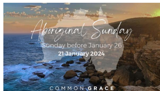
Common Grace (2024) Promotional material for Aboriginal Sunday. Used with permission.