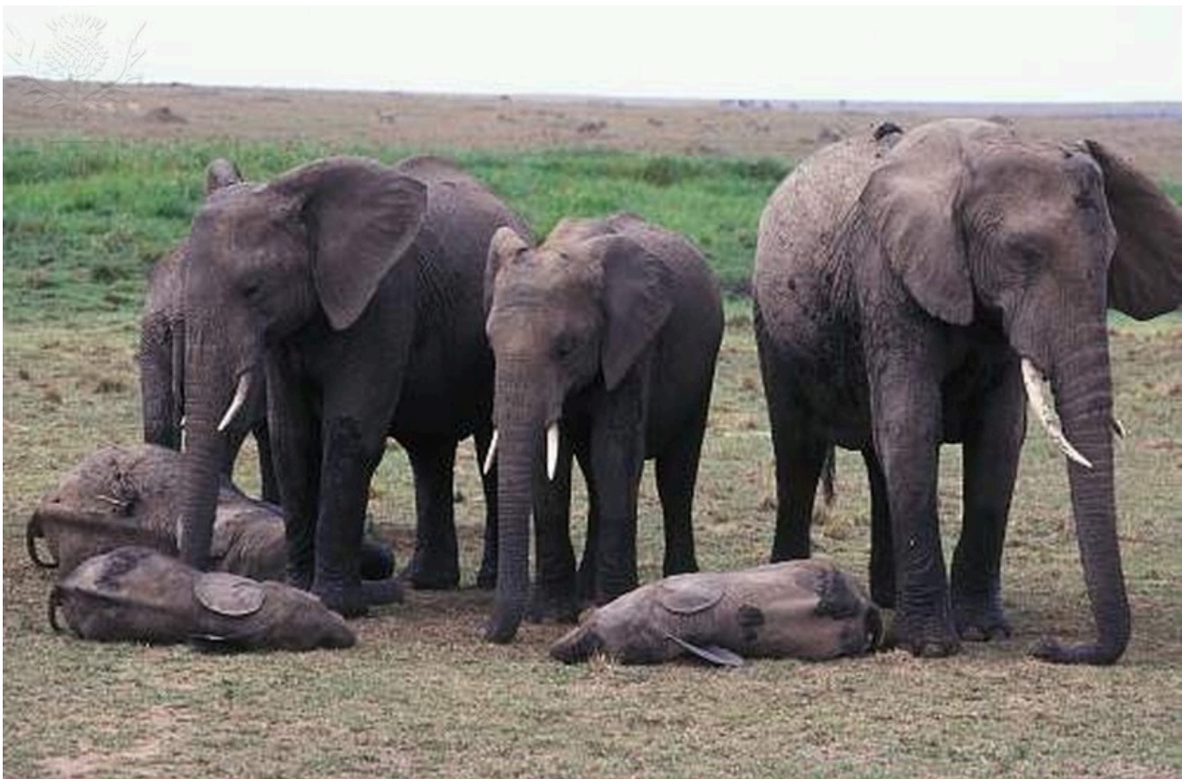
Image 2: Herd of elephant resting.

In so doing, we are damaging our relationship with other humans, particularly those least equipped to defend themselves: the poor and future generations. We are forgetting our interconnectedness with the earth and with those around and ahead of us who depend on our good stewardship of the gift of creation.