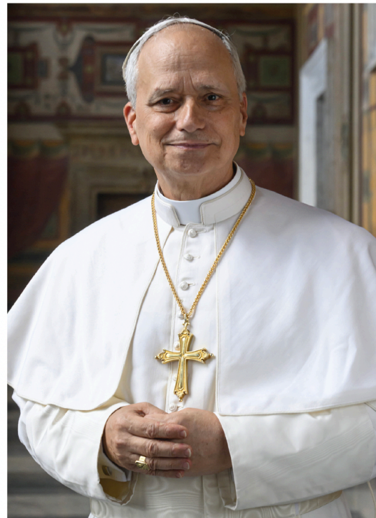
Pope Leo XIV

Take me for your model, as I take Christ. 1 Corinthians 10:31 – 11:1