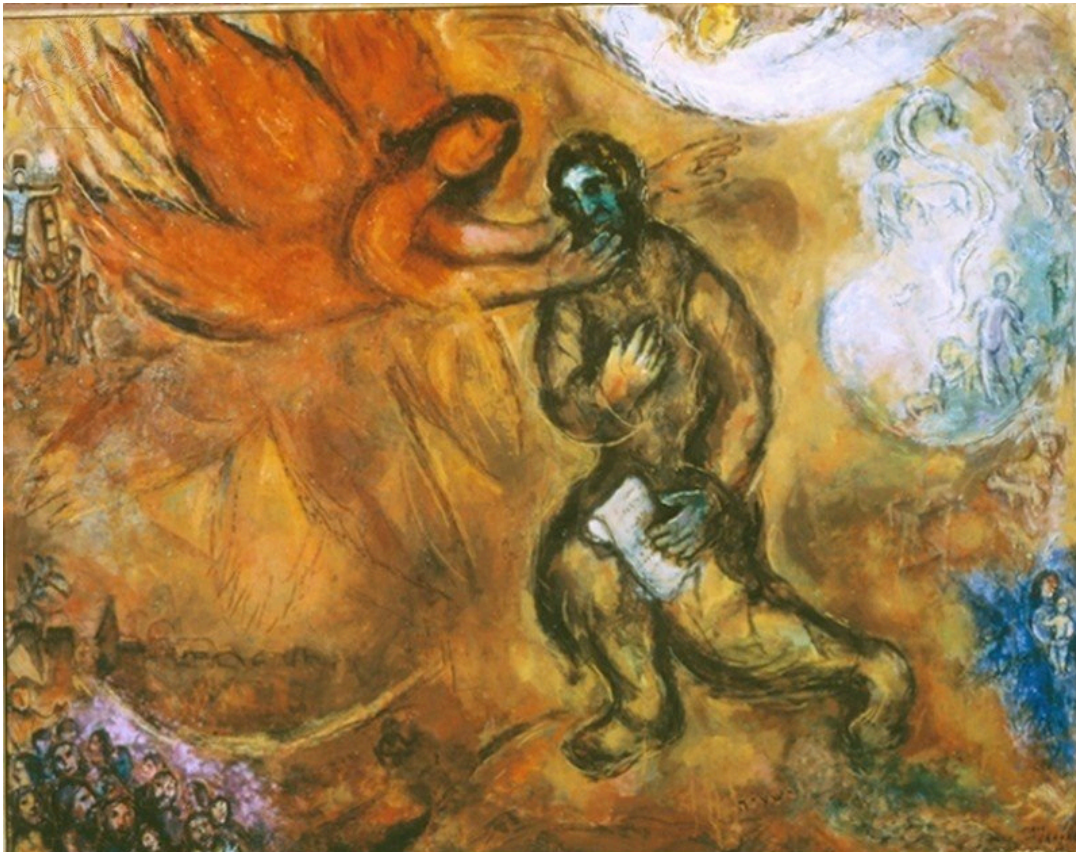
The Prophet Isaiah. Fine Art. Encyclopædia Britannica ImageQuest, Accessed January 30, 2026. https://quest.eb.com/images/525_2905544 .

In the midst of increasing fragmentation of society, polarisation of discourse and distrust in institutions, people have - and continue to be - denied their right to live in peace, with justice and in dignity. I believe this is not the vision for our nation that we seek to share to the next generation. How can we shift from the shadows into a more enlightened way of being community to one another?