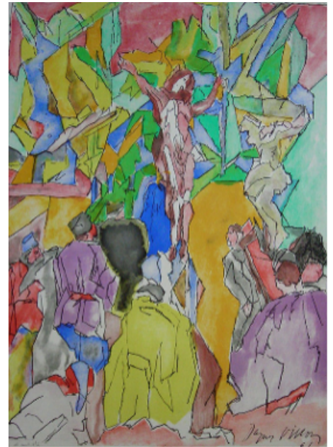
Figure 5: Jacques Villon. Sacred Art Meditations, Accessed March 24, 2026 http://sacredartmeditations.com/life/detail/19

Write about your worries, hurts or burdens and ask God to help you carry them. If not God, who can help you?