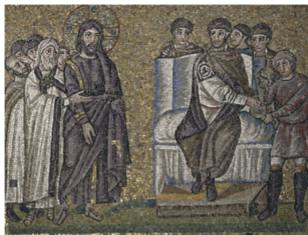
Figure 4: Christ before Pontius Pilate, mosaic. Photograph. Encyclopædia Britannica ImageQuest, Accessed March 24, 2026. https://quest.eb.com/images/126_139433 .

What are some things in our world that are not fair? Is there is a positive action you can take against the injustice.