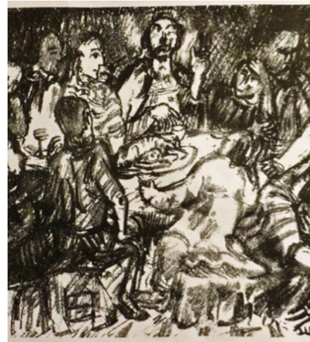
Figure 2: Oskar Kokoschka. Sacred Art Meditations, Accessed March 24, 2026 http://sacredartmeditations.com/life/detail/37

Jesus shared his final meal with his companions, or friends. Who are the people you consider your good friends? How could you thank them for what they do for you? What is it that you bring to your friendships? To your workplace?