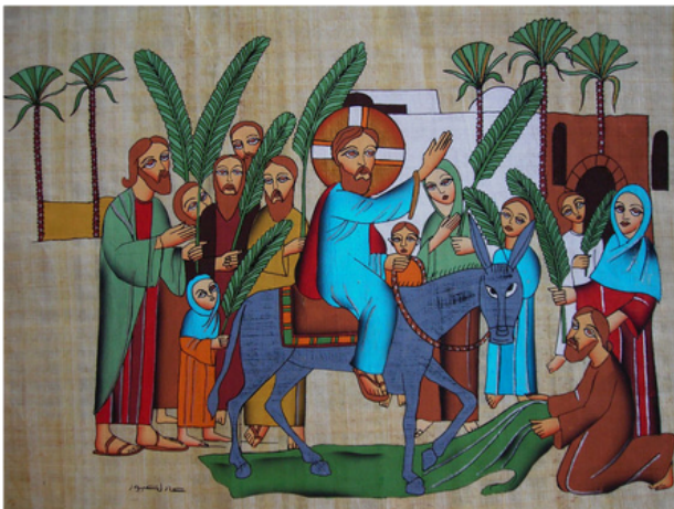
Figure 1: Depiction of Palm Sunday, Unknown Artist. Sacred Art Meditations, Accessed March 24, 2026 http://sacredartmeditations.com/life/detail/30

The Passion moves between moments of triumph, glory and joy, to those of tragedy, defeat and sorrow. There is challenge in carrying our own crosses, but these too bring strength. Just as Jesus stumbled and fell on his journey to Golgotha, we too stumble. We experience doubt and weakness. Being a person of faith is not always easy. May we journey with Jesus through Holy Week and Easter, acknowledging the burdens we carry but also finding ways to reach out with care and compassion to others, just as Simon and Veronica did in Jesus' last moments. May we find ways to act with justice.